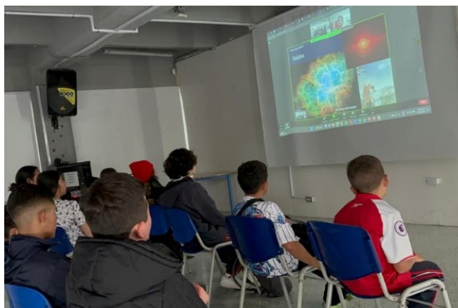
Students attending the Astronomy interest center