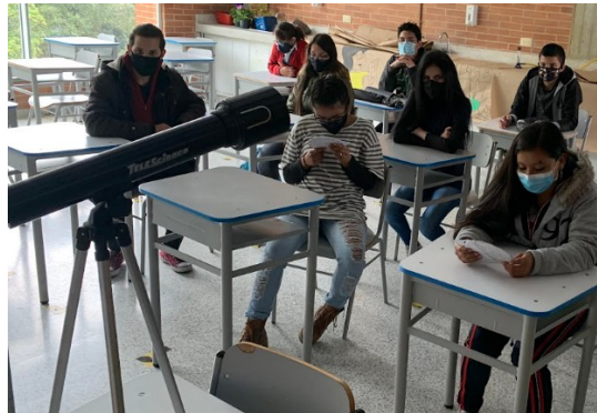
Students starting the astronomy club, year 2021

Note. Retrieved from: https://sites.google.com/view/cienciaytecnologamoralba/