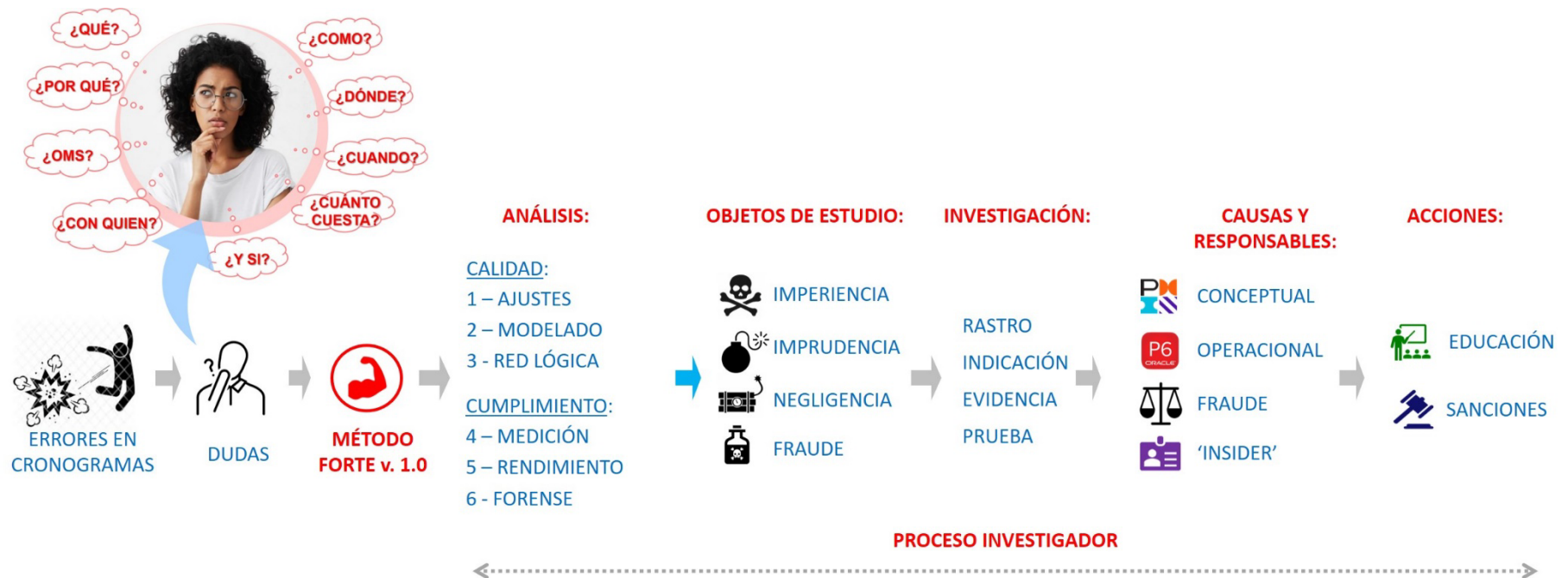
Figure 7 Simplified investigative process of the FORTE Method v. 1.0.