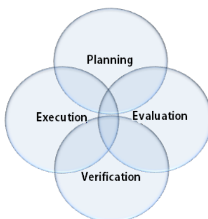
Figura 2. Integration of the project management model

According to the data obtained in the fieldwork carried out, the following methodological model is proposed in general as follows: