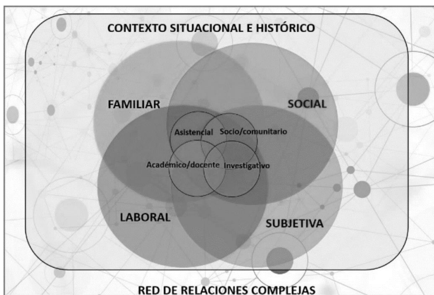
Figure 14: Integral cross-linking; model components and intervention dimensions