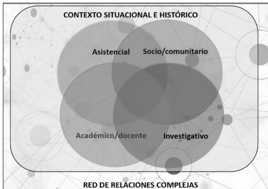
Figure 1: Axes or components of the care model

The care model designed is organized into four axes and/or components: Welfare, social/community, academic/teaching, and research. It is proposed in accordance with the National Mental Health Plan, the Uruguayan Mental Health Law and the international literature on the subject. The conceptual and procedural characteristics and principles of the model of care are based on Health Promotion, Social Determination of Health, Critical Epidemiology, Critical Psychology, Health Psychology and Family and Community Medicine.